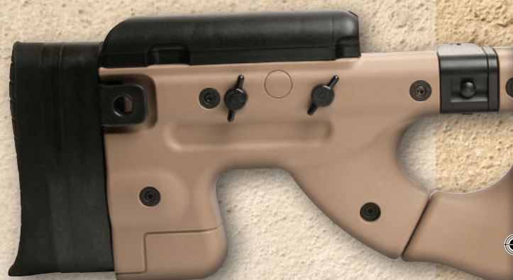
Accuracy International folding stock design is certainly versatile, if not to your liking, then a GRS stock can be substituted

The Nimrod is well designed with a smooth bolt and positive cartridge delivery and good detachable mag system, which is further enhanced by the excellent Lothar Walther barrel. Accuracy was not only excellent but consistent and dependable in all field conditions. A good trigger makes all the