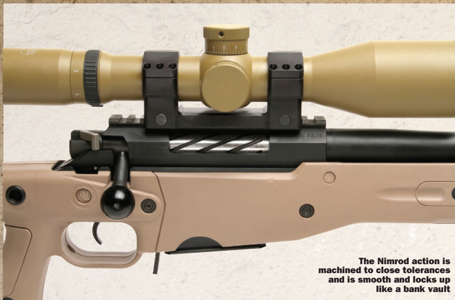
The Nimrod action is machined to close tolerances and is smooth and locks up like a bank vault