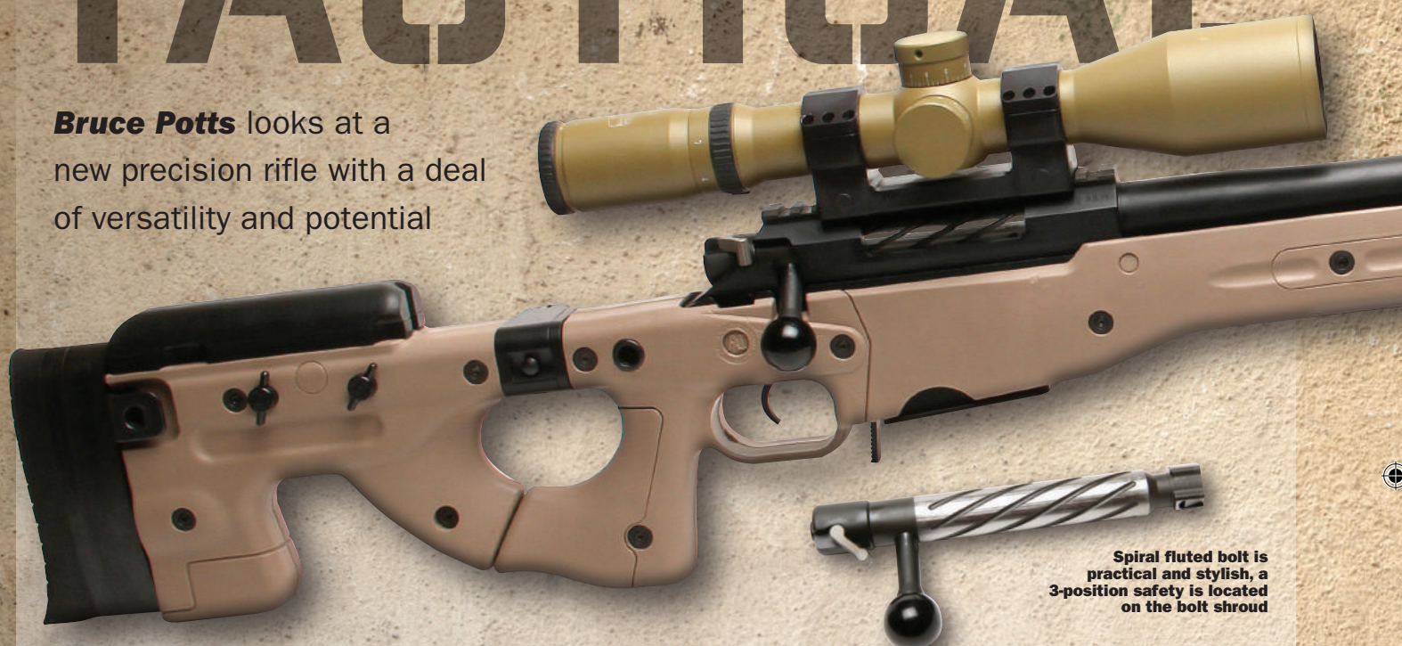
Spiral fluted bolt is practical and stylish, a 3-position safety is located on the bolt shroud

Bruce Potts looks at a new precision rifle with a deal of versatility and potential