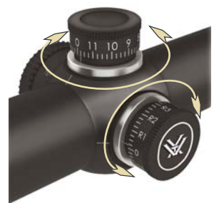
To adjust settings, turn knobs · Up / Down · Left / Right

After sight-in, you can realign the zero marks on the