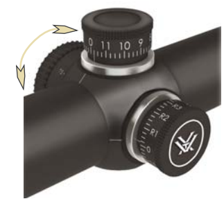
Adjust the side parallax knob

• Check the setting for accuracy by looking through the scope to verify image sharpness and, at the same time, look for reticle shift while moving your head back and