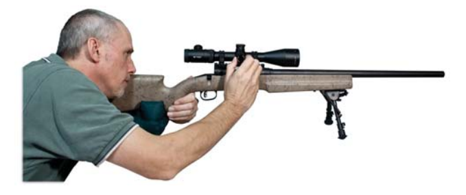
Visually bore-sighting a rifle.

• With the target centered in the bore, make windage and elevation adjustments until the reticle crosshair is also centered over the target.