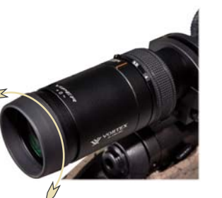
Adjust the reticle focus

as the eye will try to compensate for an out-of-focus reticle.